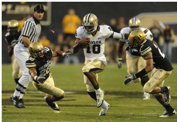
Robert Griffin III picked up big yards on a second quarter keeper up the middle.

BOULDER — A team whose margin for error this season is as thin as a pink slip, Colorado had too many slips Saturday night against one of the most dynamic players in college football.